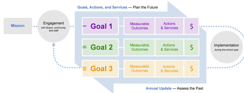
Graphic 1. LCAP Continuous Improvement Cycle

The graphic above provides an outline for the remainder of the document that enables stakeholders to more easily navigate to the section that they want to read. Below is a brief explanation of each element.